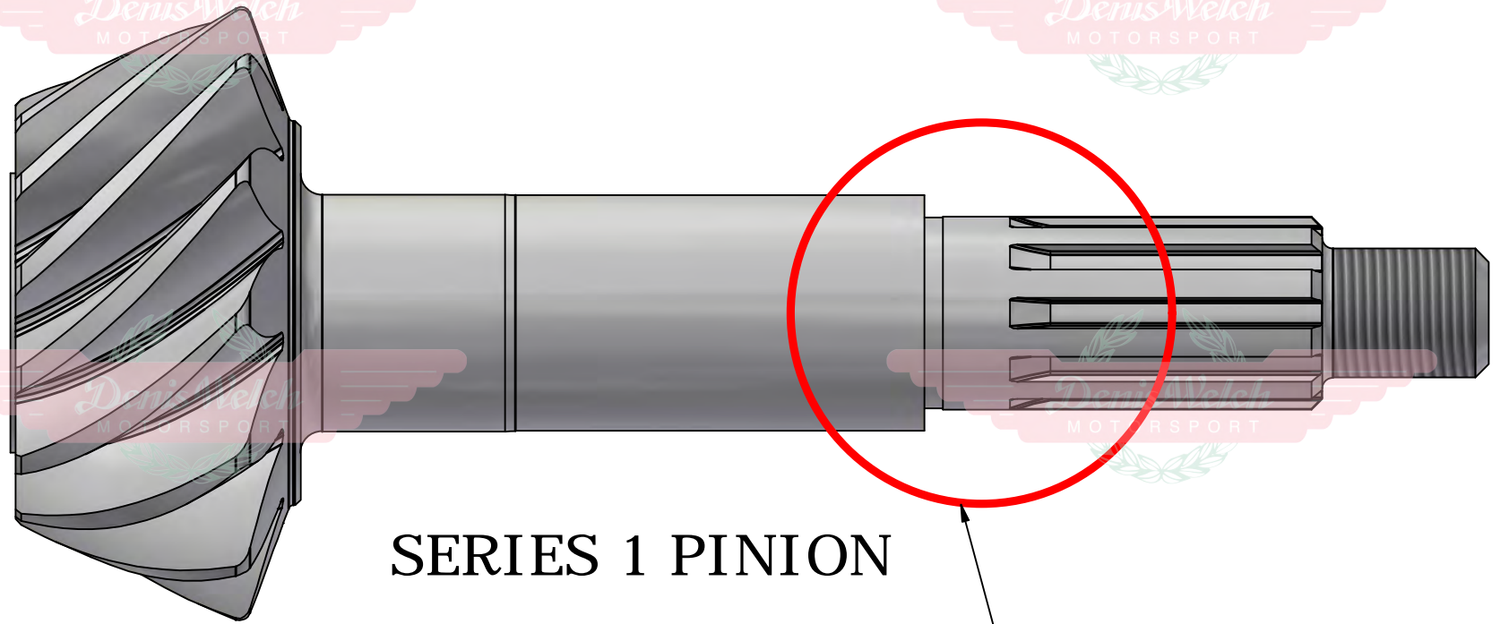
SERIES 1 PINION