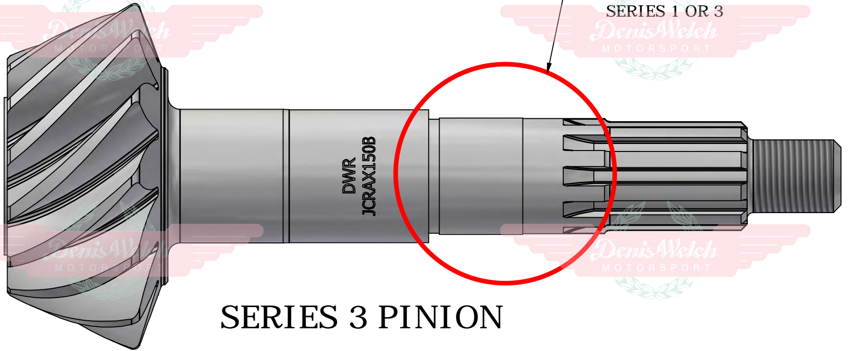
SERIES 3 PINION

NOTICE DIFFERENCE IN LENGTH FROM SPLINE TO IDENTIFY SERIES 1 OR 3